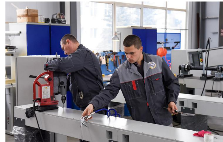
«Nauka» Industrial facility